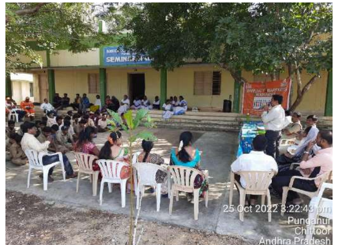
25 Oct 2022 3:22:49 pm Punganur Chittoor Andhra Pradesh