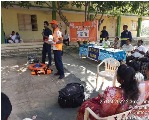
25 Oct 2022 2:36:41 pm Punganur Chittoor Andhra Pradesh