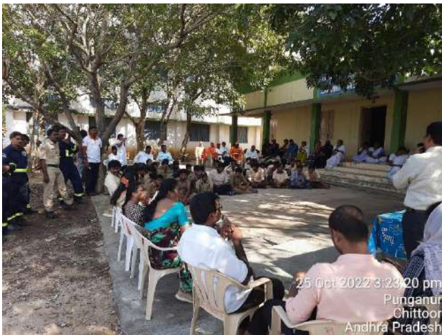
25 Oct 2022 3:23:20 pm Punganur Chittoor Andhra Pradesh