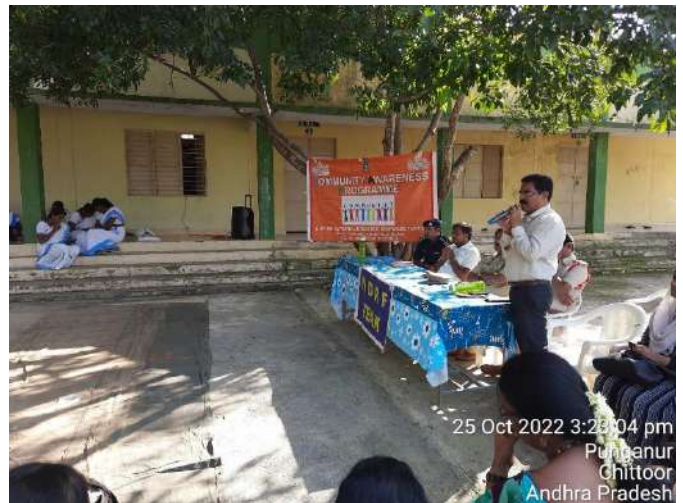
25 Oct 2022 3:28:04 pm Punganur Chittoor Andhra Pradesh