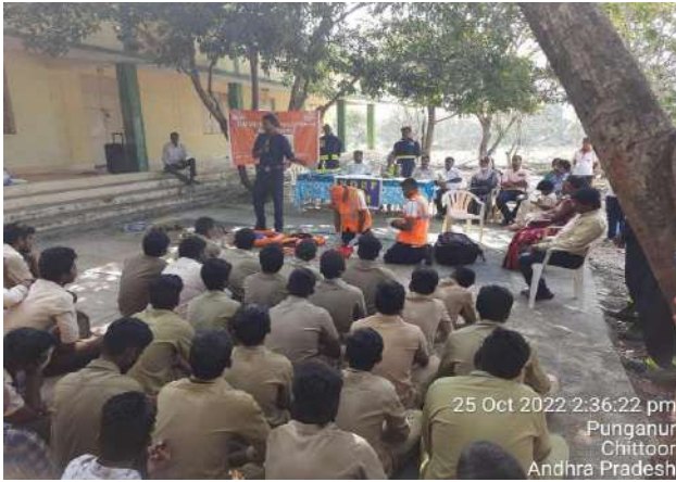
25 Oct 2022 2:36:22 pm Punganur Chittoor Andhra Pradesh